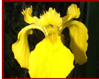
Yellow Flag Iris