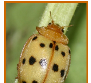
Mexican Bean Beetle