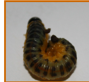
Dog wood sawfly