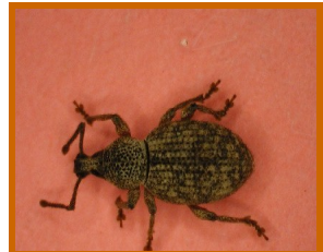
Clay colored weevil