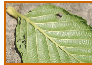
Alder flea beetle