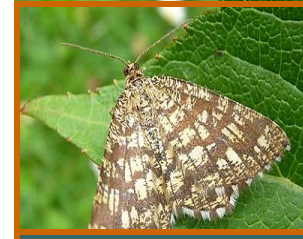
Holly bud moth